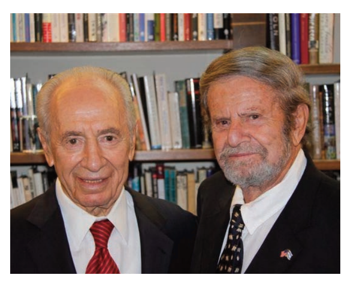
President of Israel Shimon Peres with Tad Taube.