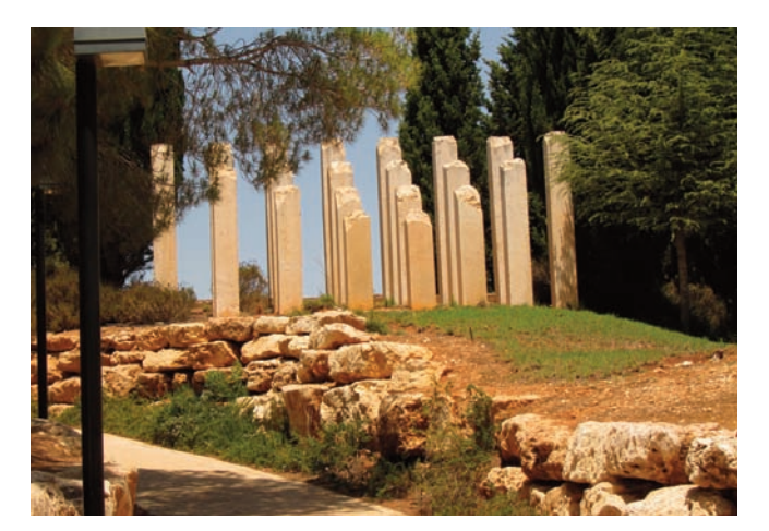
Memorial site at Yad Vashem.

dor, Deputy Prime Minister and Minister of Intelligence, who also expressed optimism for the outcome of the meeting between Netanyahu and Obama. We also met with Matan Vilnai, Deputy Defense Minister, who spoke with passion about the priorities of national defense and left us with a feeling that Israel is in good hands.