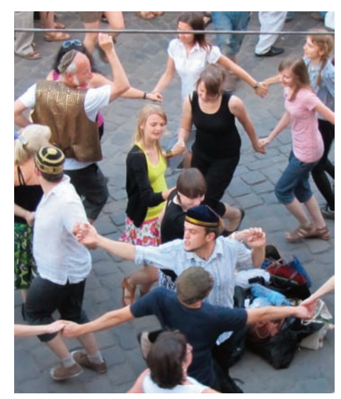
Right, the closing night concert of the Jewish Culture Festival in Krakow draws thousands, with dancing in the streets, above, a common sight.

U.S. Secretary of State Clinton, whom we had the honor of meeting at a press conference in Krakow's new Oskar Schindler Museum, announced a $15 mil-