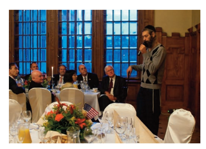
World-renowned American reggae musician Matisyahu performs a Fourth of July tribute.