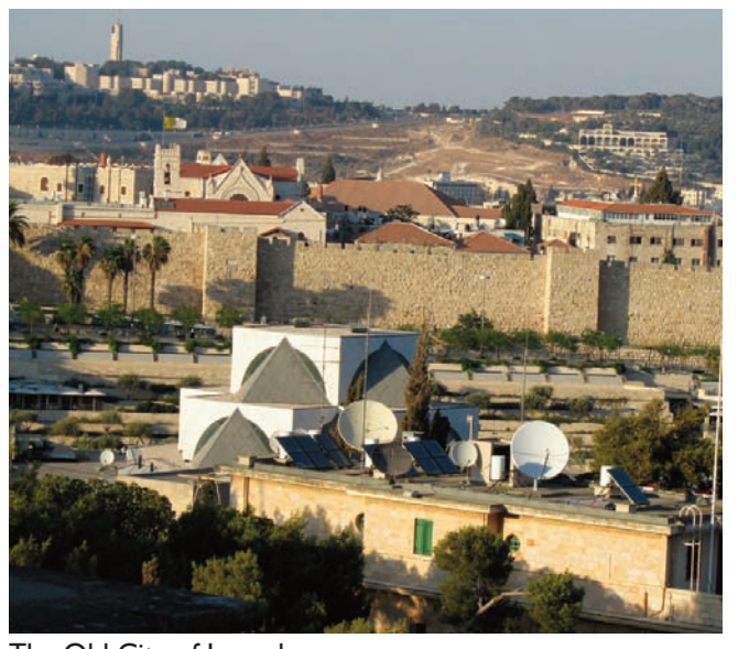
The Old City of Jerusalem.