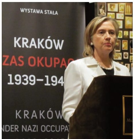
In Krakow, U.S. Secretary of State Hillary Clinton announces a $15 million Congressional allocation to preserve AuschwitzBirkenau.

grimage to Warsaw and Krakow took place from June 29-July 4.