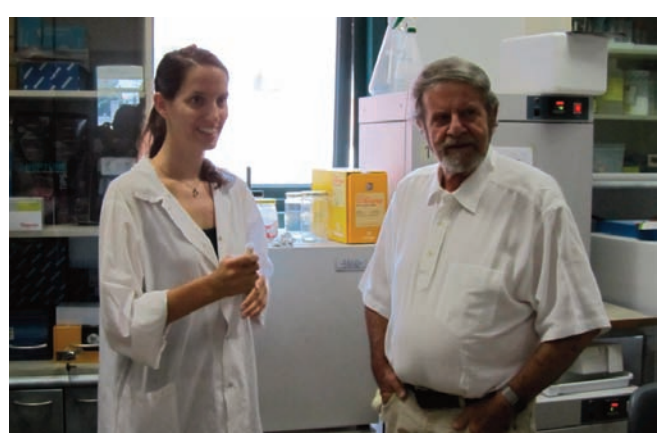
The new research facilities in Rehovot of the Koret School of Veterinary Medicine at Hebrew University.

entific pursuits. He expressed the hope that support of Israel by younger Americans would be attracted toward these pursuits.