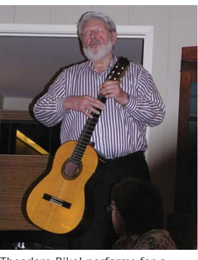
Theodore Bikel performs for a delighted gathering.