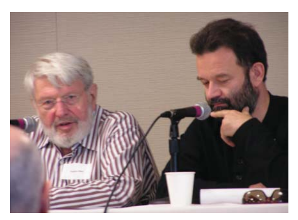
Theodore Bikel and Janusz Makuch discuss "Jewish Cultural Renewal: Reflections from Europe & the U.S."