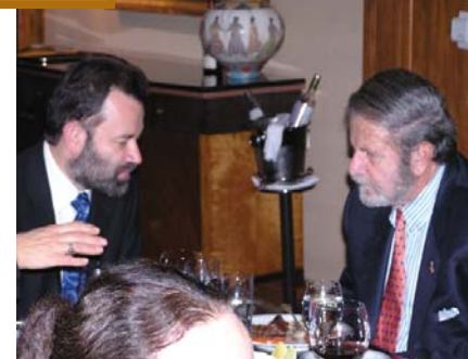
Presented by the Jewish Heritage Initiative in Poland, Taube Foundation for Jewish Life & Culture