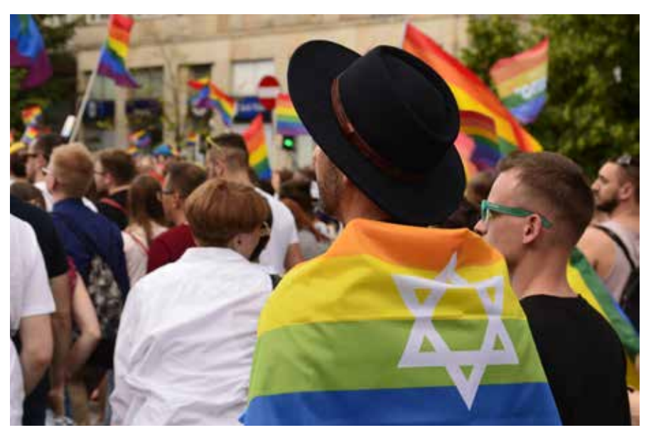
A participant in the Equality March in Warsaw.

ome one hundred members of the Jewish community of Warsaw joined more than 47.000 marchers in the city's annual Equality March on June 8. Marching together, Jewish participants carried Jewish Pride flags, the Israeli flag, and a rainbow kippah. The parade held particular significance, given the heated national debates over issues such as gay marriage and the adoption of children by gay persons measures that the ruling Law and Justice Party opposes.