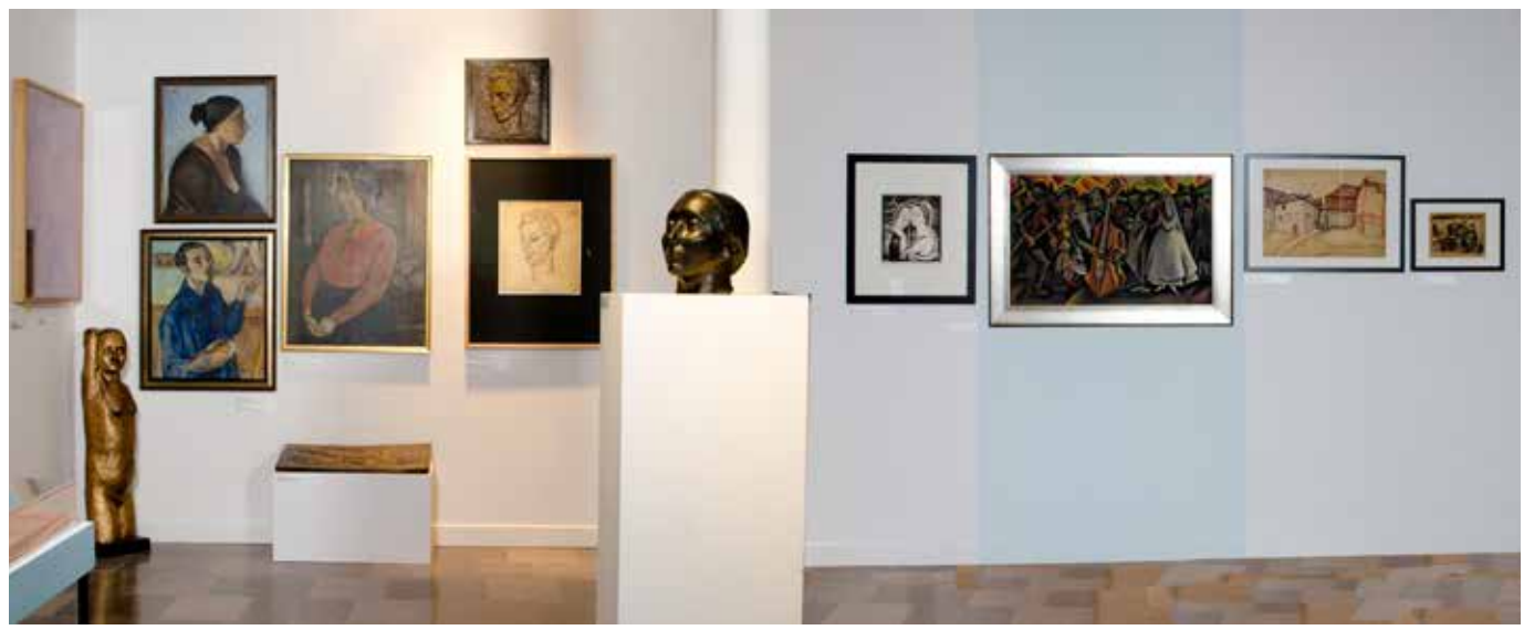
The exhibition Expressions of Freedom at the Museum of the City of Łódź.

Although that exhibition was never realized, Expressions of Freedom has fulfilled the promise of 100 years ago and brought together work from both groups. Drawn from the collections of the National Museum in Poznań, the Museum of the City of Łódź,