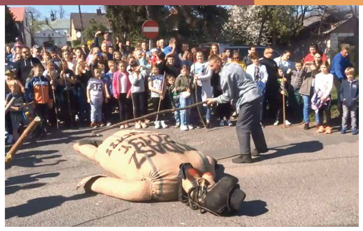
Pruchnik residents beat the effigy of Judas.

for Dialogue with Judaism, Conference of the Polish Episcopate, declared that "the Church expressly disapproves of such practices that violate human dignity." Interior Minister Joachim Brudziński called the ritual "idiotic" and "pseudo-religious."