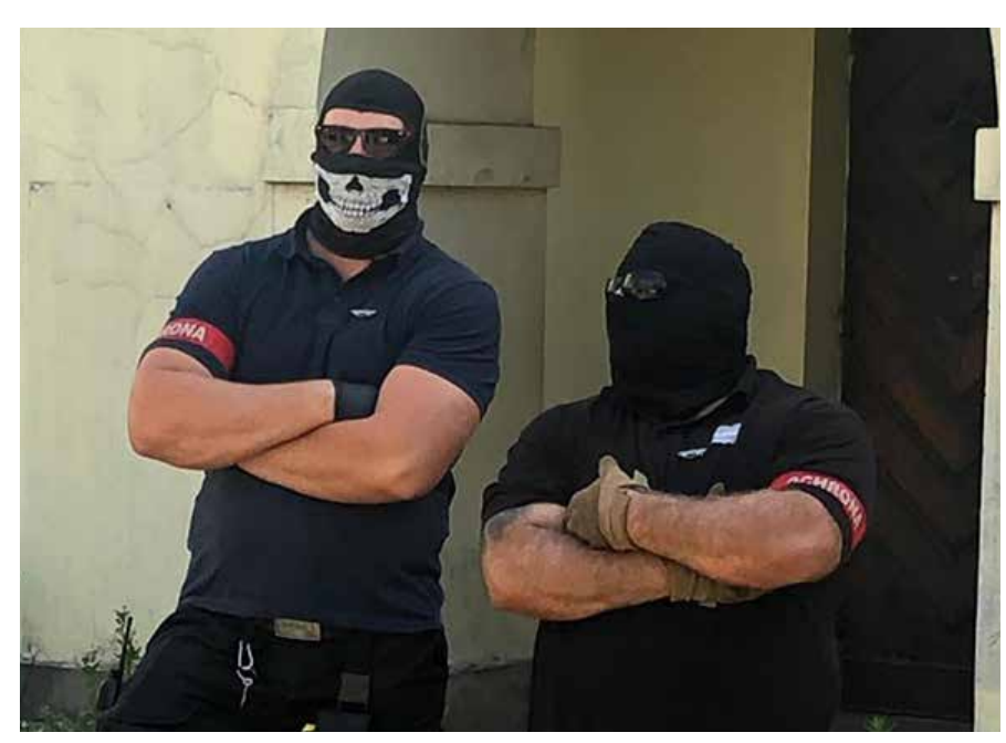
Masked security guards, hired by the Gmina, stand in the courtyard of the Izaak Synagogue on Monday, July 1.

For many years, the job of the Gmina was to take care of Jewish matters such as the cemetery, the synagogues, and other Jewish needs then came the Holocaust and communism during which the position of the Gmina