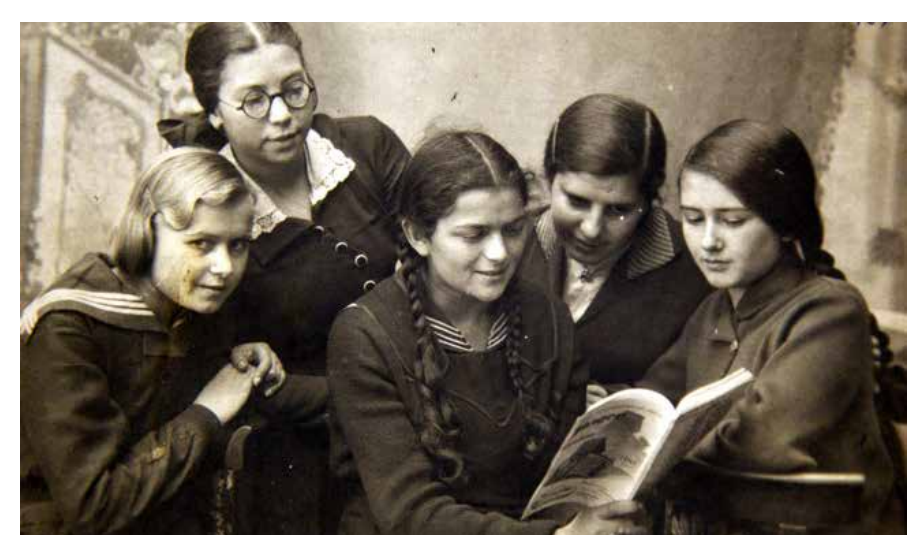
Four Jewish students posing with a non-Jewish friend at the State Gymnasium in Chełm, Poland, 1934.

Panels addressed the larger theme from several perspectives: Public Memory and Public Jewry; The Jews and the Politics of Culture; Beyond Auschwitz: Reflections