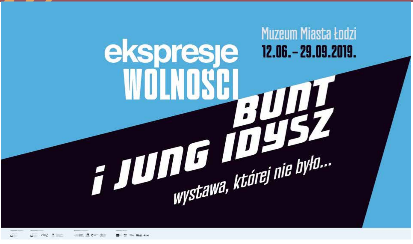
Poster for the exhibition Expressions of Freedom at the Museum of the City of Łódź.

the Museum of Art in Łódź, the Jewish Historical Institute in Warsaw, and several other institutions and private collectors, the exhibition contains about one hundred original drawings, paintings, photographs, bas-reliefs, and posters created between the 1910s and the late 1940s. The artworks are supplemented by thorough notes and documentation, as well as the complex biographies of the artists.