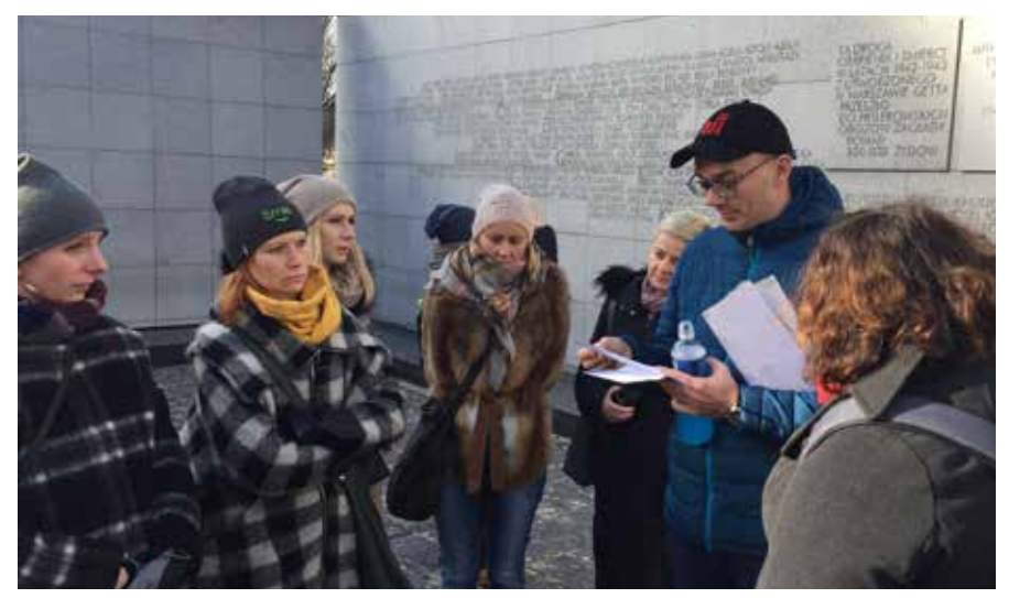
Participants in the Academy of Anti-Discrimination Education at the Umschlagplatz in Warsaw.

In recent sessions, participants heard presentations from Poland's leading academic