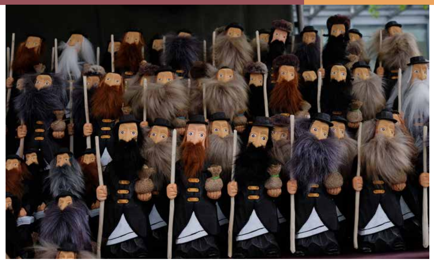
Traditional "Jews with coins" sold at the Emaus Easter market in Kraków.

and clever re-appropriation of a problematic practice. On other hand, I've wondered if the performance makes fun of people buying the images in an unfair way and perpetuates the stereotype it aims to critique, or otherwise gives permission to others to continue buying and selling them—what is the good of satire if its message is lost on its primary audience?