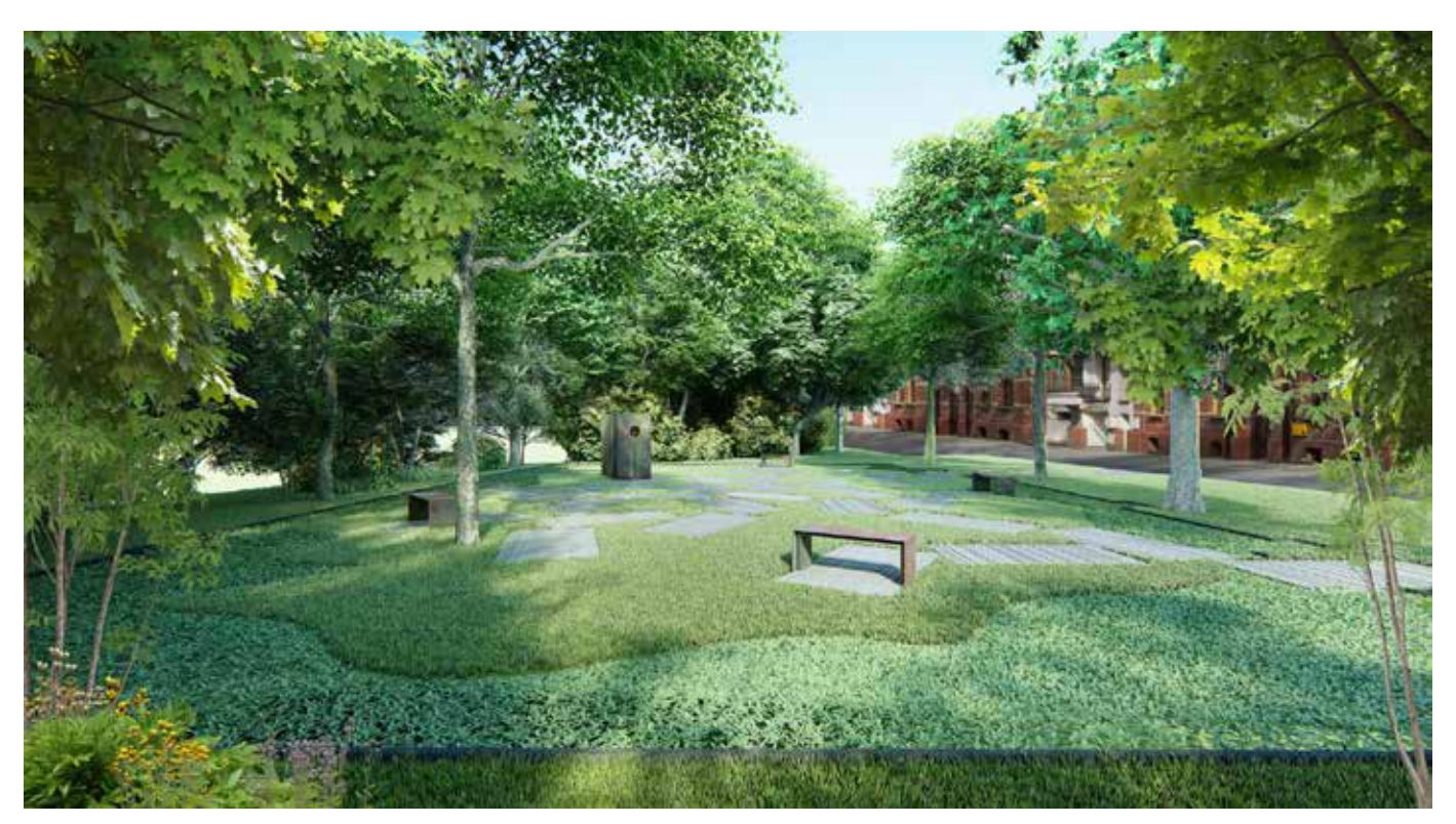
The planned memorial site of the Great Synagogue in Oświęcim.

The Auschwitz Jewish Center in Oświęcim, through its creation of the Memorial Park, will combine commemoration and reflection through art installations and historical education. The Memorial Park is co-funded by institutional and private donors from Poland and beyond, including funds from descendants of Holocaust survivors from Oświęcim,