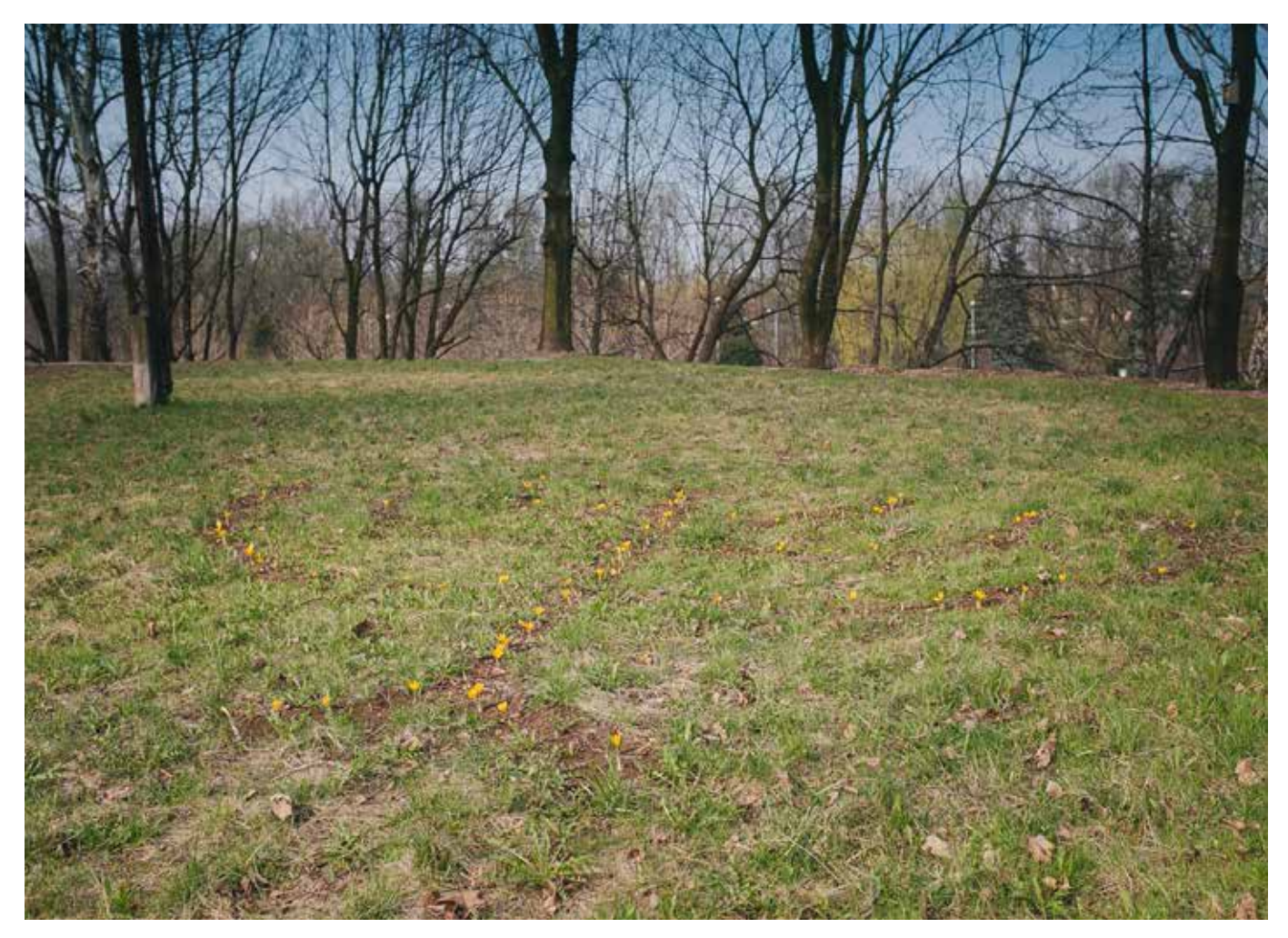
The site of the Great Synagogue in Oświęcim as it looks today.