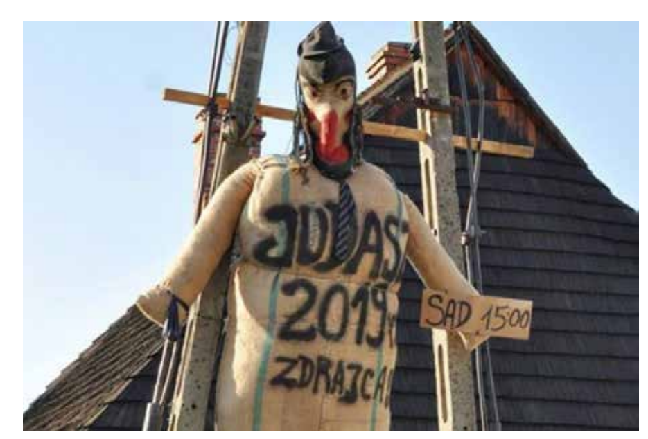
The Judas effigy hanging in Pruchnik.

This year, on April 29, such an incident was brutally recreated in the southeastern town of Pruchnik (population 3,800). In this local demonstration, a straw-filled replica of Judas was instead made to look like a stereotypical Hasidic Jew, with sidelocks, dressed in a black coat and a widebrimmed hat. Many local children participated alongside the adults in beating the effigy with sticks, decapitating