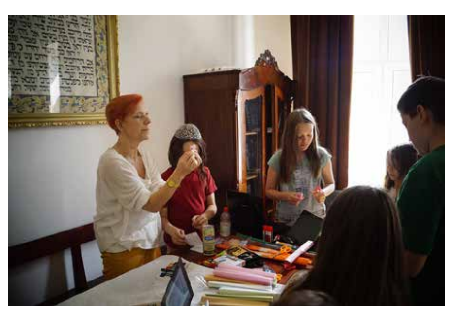
A workshop for children at the Festival of Tranquility.