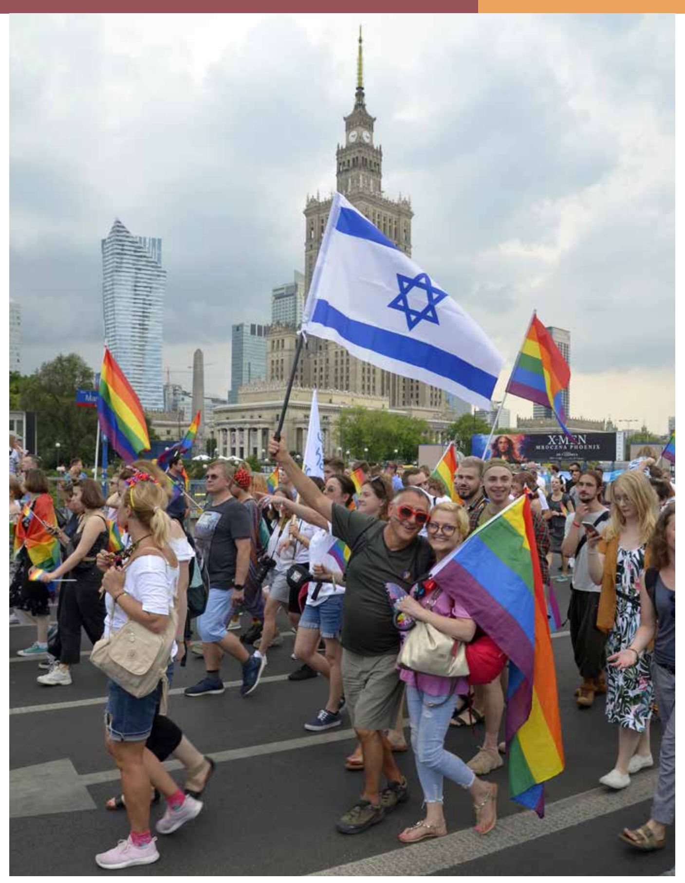
The Jewish bloc of the Equality March walking past the Palace of Culture and Science. Photograph by Krzysztof Bielawski. Used with permission.