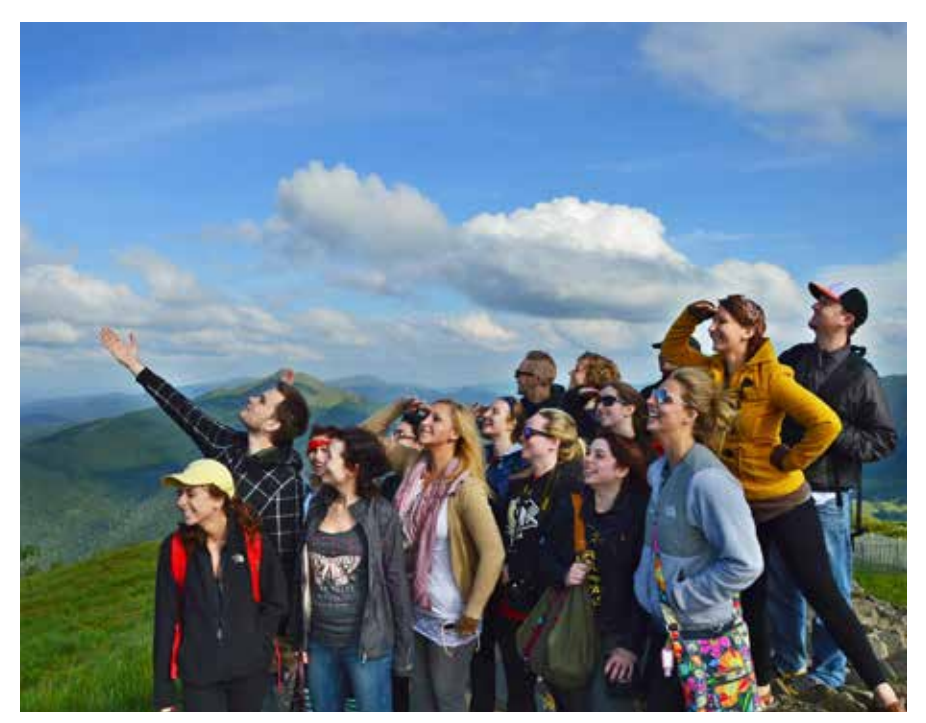
Participants in the inaugural summer program, "Towards a 21st Century Polonia: Explore, Connect, Get Involved" (Summer 2014)

Deadline for application is April 15, 2015. Almost all expenses per student are covered by the grant, excluding international airfare, travel insurance, and personal expenses. Please share this announcement with students and friends.