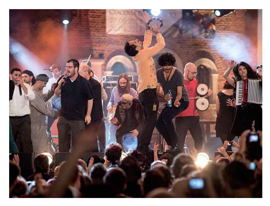
Shalom on Szeroka, the final concert of the week-long Jewish Culture Festival

Each of the past 24 Festivals has built upon the success of the previous year's Festival. Reaching the 25th anniversary gives us an opportunity to reflect on our Festival's achievements and sustainability. We decided