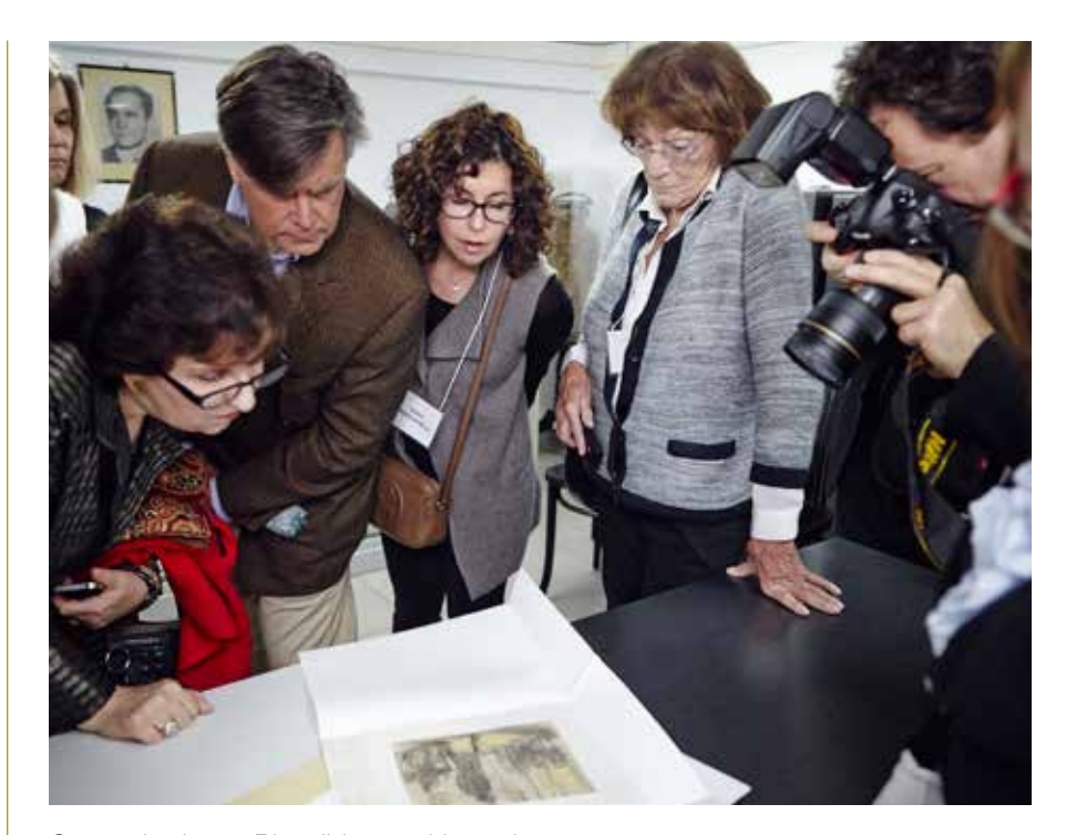
Group viewing of Ringelblum archive artifacts

The JHI's most treasured collection is the Emanuel Ringelblum Archives. Ringelblum, a historian, organized a clandestine network of writers, journalists, historians and artists in the Warsaw Ghetto, called Oyneg Shabes , to document Jewish life and death during