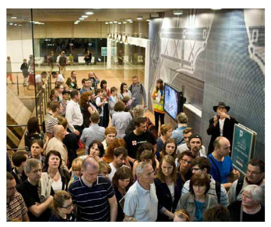
Group Tour of POLIN Museum

The Global Education Outreach Program (GEOP) aims to transmit the POLIN Museum's educational message and unique resources