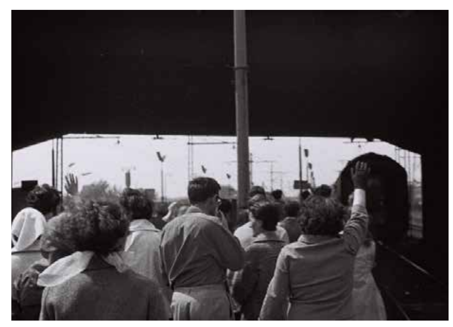
Farewell to Gdańsk Station

Some of the Jews born after WWII undertook to give new meaning to their Jewish origins. Starting in the late 1970s they created their own identity, ab initio as it were, learning the history and customs of the