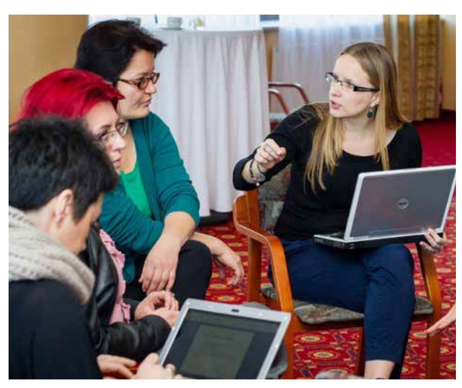
CENTROPA Workshop

The CENTROPA Summer Academy will also spend a