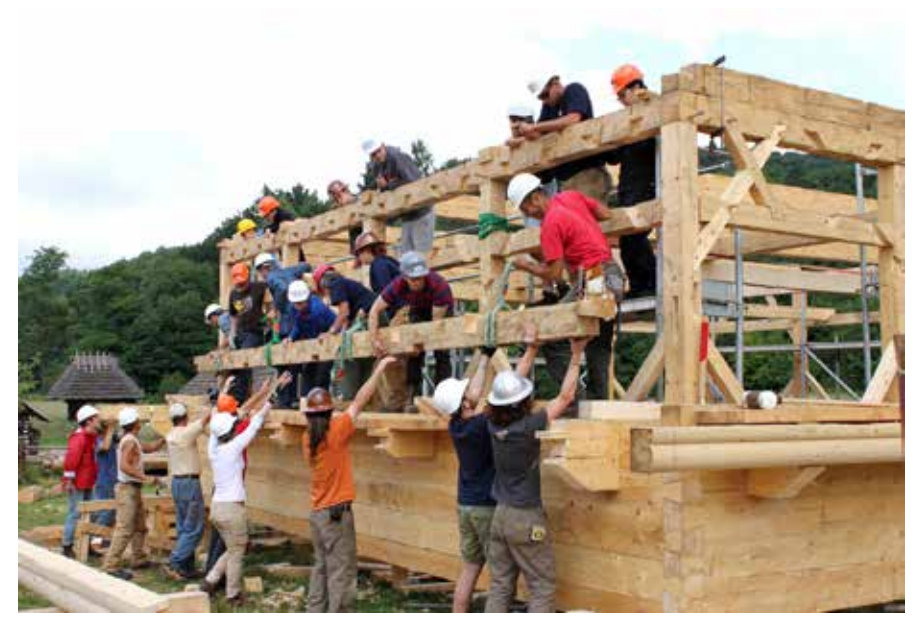
Volunteers work on the Gwoździec Synagogue Project in Sanok, Poland.

Raise The Roof follows the Browns and the Handshouse Studio team to Sanok, Poland, as they begin building the new Gwoździec roof. The crew has only six weeks to hew, saw, and carve 200 freshly logged trees and assemble the structure. Working against a seemingly impossible deadline and despite torrential downpours and exhaustion, the team must create the structure, and disassemble it again for shipping and eventual installation.