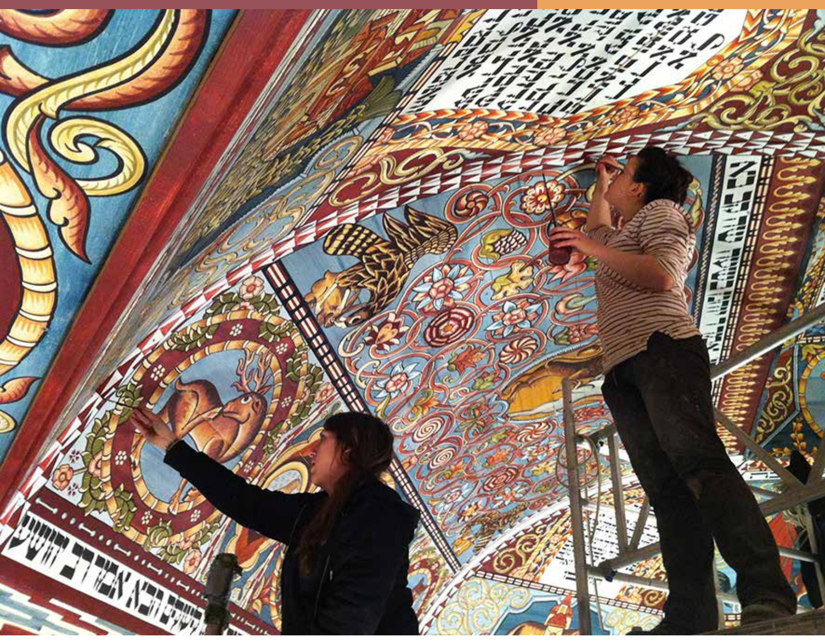
Volunteers painting the elaborate ceiling of a close-to-scale replica of the Gwoździec Synagogue

may come from families who converted to Christianity several generations ago or who hid their Jewish origins from their children. Many people expect the exhibition to celebrate the contributions of Polish Jews, broadly defined, to Poland and the world – in medicine, science, law and politics, in Hollywood, and