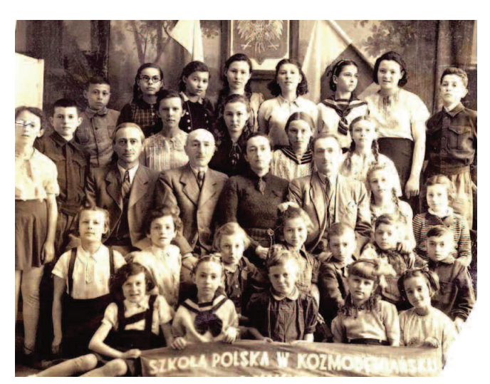
Archival photographs may trigger memories and unearth surprising connections.

Increasingly, we find ourselves being approached by individuals, law firms and real-estate development firms in-