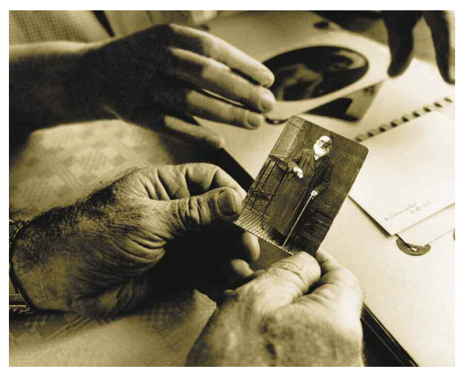
Digitizing our vast repository of photos will make our holdings available to the public.

An Israeli professor came to us insisting that his family